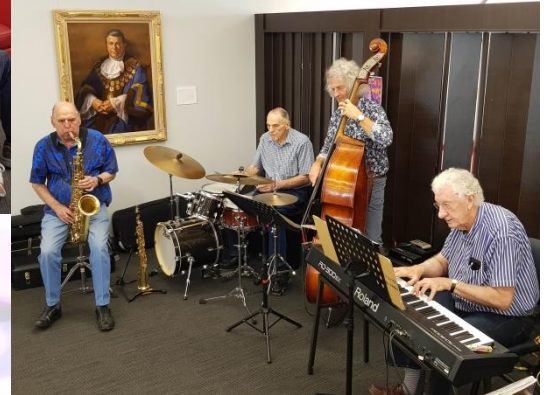
Spellbound performed a gig at the StudPark Library, at the StudPark Shopping Centre, as part of a promotion for the Jazz Archives on Wednesday, 30th October 2019